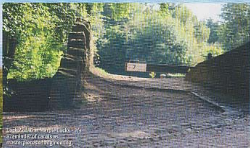
Lock 22 at Marple Locks. It's a reminder of canals as masterpieces of engineering.

As you head off along the canal from Marple Locks, you're walking into a